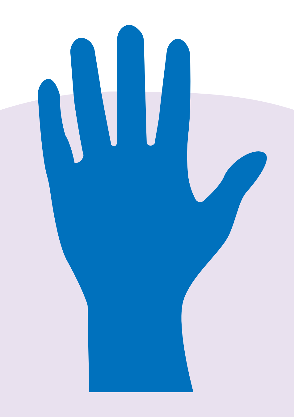
Feel the object. What do you notice?