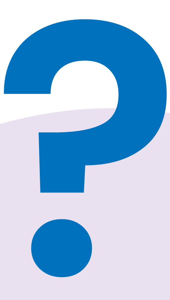
What else do you notice?